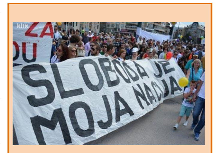
'Freedom is my nationality': one of the posters at the JMBG protests

Most of the days the protests took the form of a friendly meeting Sarajevan families, where parents were sitting in front of the parliament building having a 'coffee for JMBG', while their children were playing, singing, drawing together. Until the end of protests, none participants claimed to mastermind the events - the protest seem to have been spontaneously organised and run by parents whose children did not have ID numbers and by citizens who supported them.