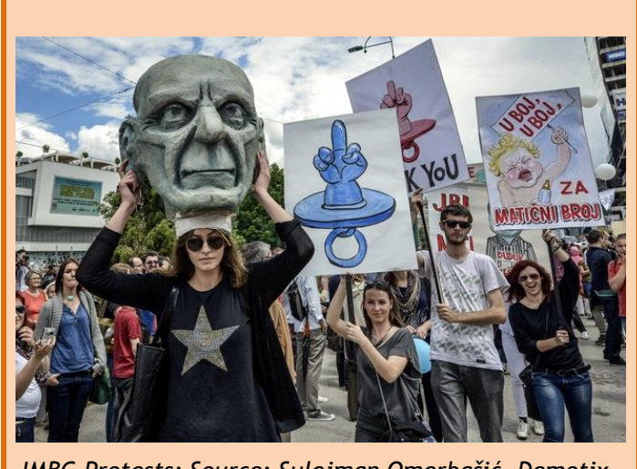
JMBG Protests; Source: Sulejman Omerbašić, Demotix

dominated Federation of Bosnia and Herzegovina (FBiH) - have not managed to find compromise solution regarding the amended version of the law. The central problem that arose was whether a regional label in the 13-digit ID number should respect the entity borders or although not, the decision in fact was not addressing this issue. Thus, the adoption of the JMBG law