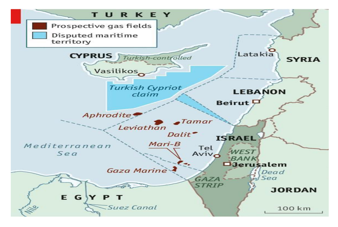
Figure 4.1 – Gas fields and T/C claims in the eastern Mediterranean

that both Tamar and Leviathan are located further to the south of the contested area. 34 Ankara's refusal to recognize Nicosia's EEZ agreements stems from the fact that it does not recognize the existence of the Republic of Cyprus since it claims that there are two states on the divided island republic. Turkey claims the near entirety -estimated at approximately 70%- of the RoC's EEZ either directly (Blocks 1, 4, 5, 6 and 7) or on behalf of the Turkish Cypriots (Blocks 1, 2, 3, 8, 9, 12 and 13), and attempted to use its military might in order to deter Nicosia and Noble Energy from carrying out the exploratory drilling that discovered the Aphrodite field in September 2011.